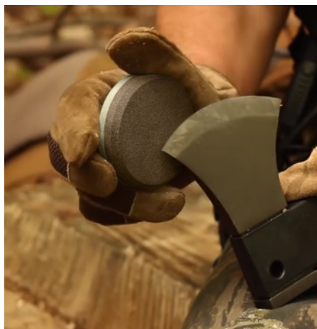
AXE SHARPENING STONE