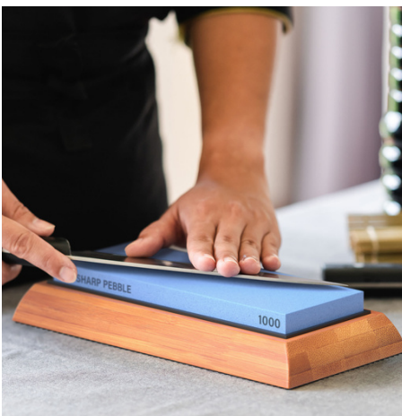
400/1000/6000 SHARPENING SET