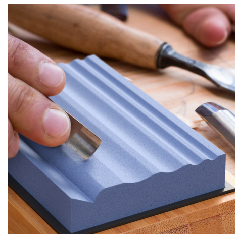
CHISEL SHARPENING STONE