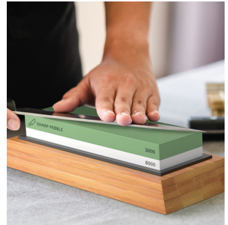
3000/8000 SHARPENING STONE