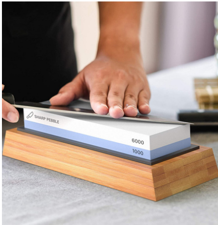
1000/6000 SHARPENING STONE